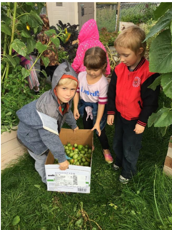
The Kindergarten classes are harvesting the green tomatoes from the garden. These tomato seeds were given to us from NASA and some seeds even went to the International Space Station.